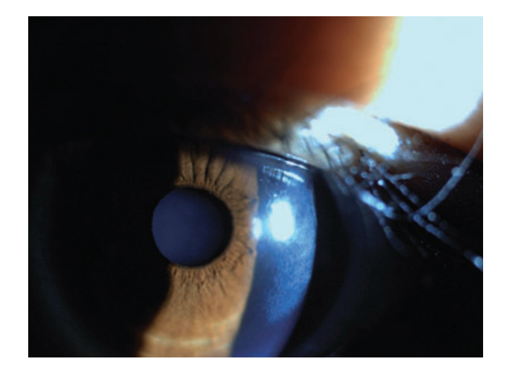
Figure 2. Photograph of the left eye eight months after flap loss. A mild corneal haze was located at the temporal side with sparing of the central visual axis.

deteriorated at night. PRK was suggested and performed with the same excimer laser. The attempted correction was -1.50/-0.65 \times 55 with the ablation zone diameter 6.0 mm. Subsequent to laser ablation, intra-operative topical 0.02% mitomycin-C (Kyowahakk O Kogyo Co Ltd, Shizuoka, Japan) was used for one minute to reduce the corneal haze. The